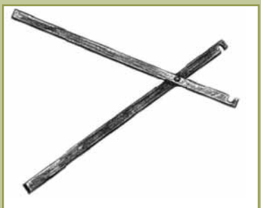
Figure NT3a. Setting tool