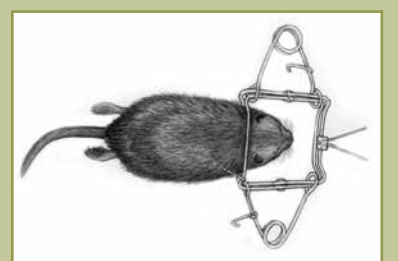
Figure NT2. Bodygrip, proper strike location