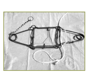
Figure NT5b. Step 2