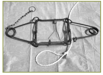
Figure NT5a. Step 1