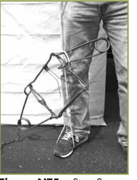
Figure NT5c. Step 3